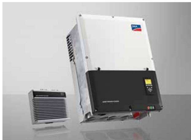
SMA Sunny Tripower Storage 60 with SMA Inverter Manager Storage