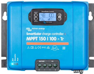
SmartSolar Charge Controller MPPT 150/100-Tr with optional pluggable display