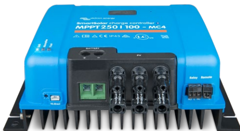
SmartSolar Charge Controller MPPT 150/100-MC4 without display